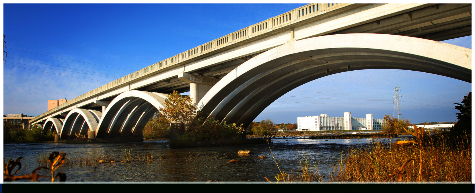
City Manager Position Open - Apply by January 8, 2016